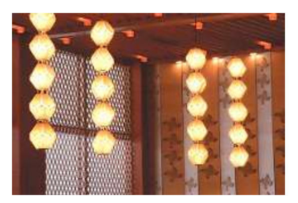
Okura Lantern ceiling lights