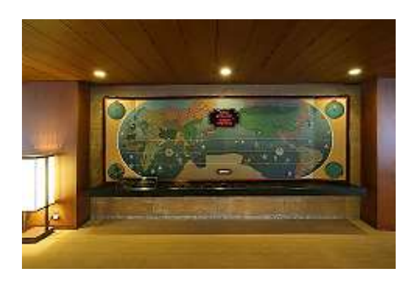
World map and clock displaying global time zones