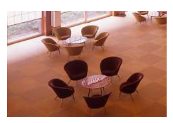
Lacquered tables and chairs