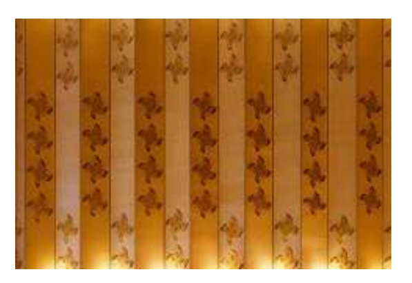
Hanging wall tapestry Four Petal Flowers