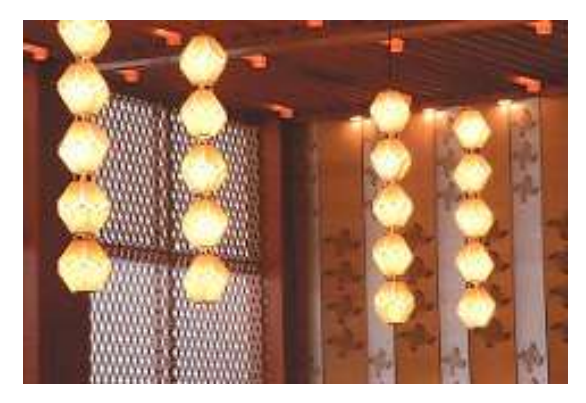
Okura Lantern ceiling lights