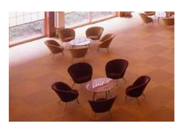
Lacquered tables and chairs