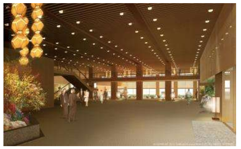
Rendition of Hotel Okura Tokyo's new main lobby

Decorations from the original facility that will grace the new lobby include the distinctive hexagonal <u>Okura Lantern</u> ceiling lights, <u>lacquered tables and chairs</u> arranged like plum flowers, <u>world map and clock</u> displaying global time zones, and the quietly elegant andon standing paper lamps.