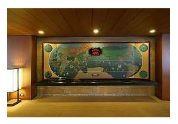
World map and clock displaying global time zones