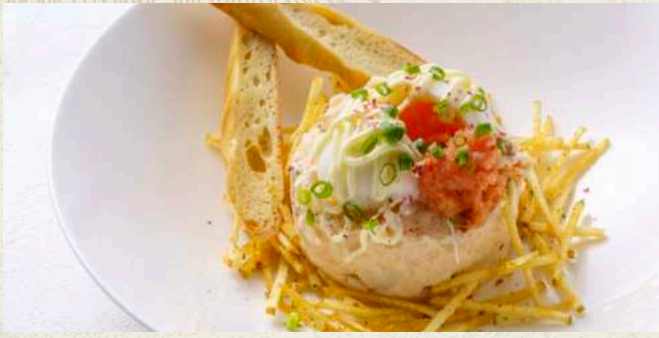
Potato salad with cod roe with Poached Egg

Made with mentaiko, a Fukuoka specialty, this dish has a creamy yet refreshing taste. It goes great with white wine or sparkling wine.