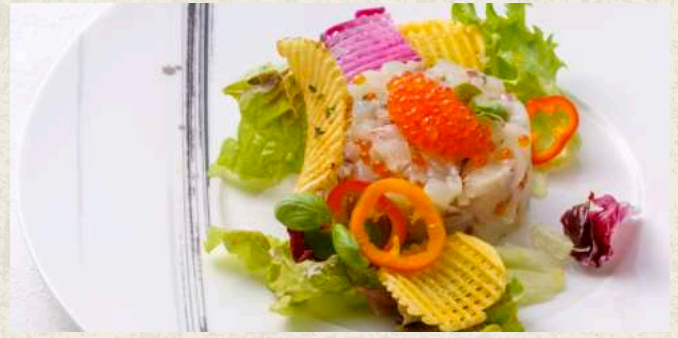
Fresh fish tartare with salad and potato gaufrette

Made with mentaiko, a Fukuoka specialty, this dish has a creamy yet refreshing taste. It goes great with white wine or sparkling wine.