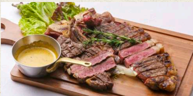
T-Bone Steak with Café de Paris Butter Sauce

This dish uses scallops, shrimp, octopus, and other seafood, and the tomato sauce is infused with the delicious flavors of the seafood, and the pasta is mixed well with it, allowing you to fully enjoy the flavors of the sea.