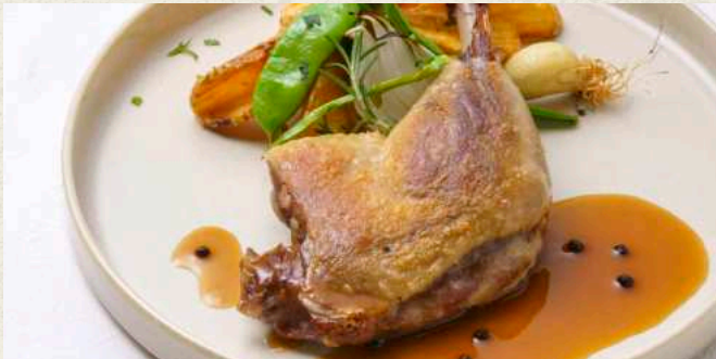
Duck Confit with Green Pepper Sauce

Fresh fish tartare is paired with potato gaufrettes, a traditional French pastry. Served with a salad to add color to the table.