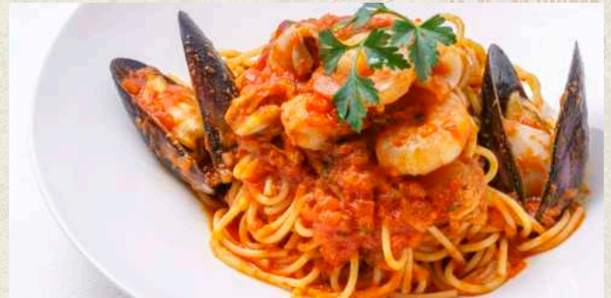
Seafood Spaghetti with tomatosauce

Duck thigh meat is slowly simmered until crispy on the outside and soft and juicy on the inside. The green pepper sauce brings out the flavor of the meat even more.