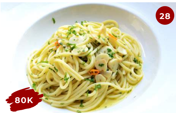
SPAGHETTI AGLIO OLIO PEPERONCINO

Tomato, prosciutto, burrata, rucola, cherry tomato, parmesan.