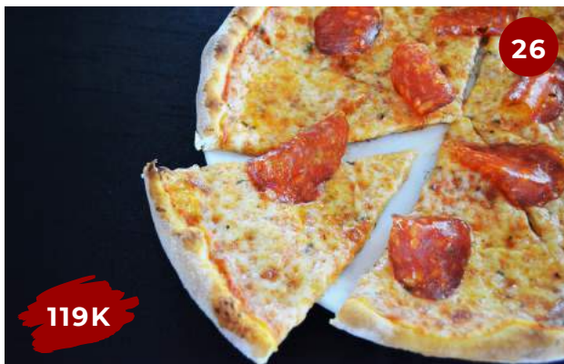
ALLA DIAVOLA PIZZA

Tomato, mozzarella, mushroom, cooked ham, artichokes, black olives.