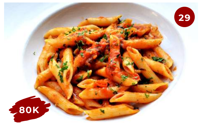
PENNE ALLA ARRABIATA

Spaghetti with garlic, olive oil, fresh chili, and parsley.