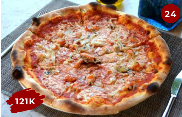
FRUTTI DI MARE PIZZA